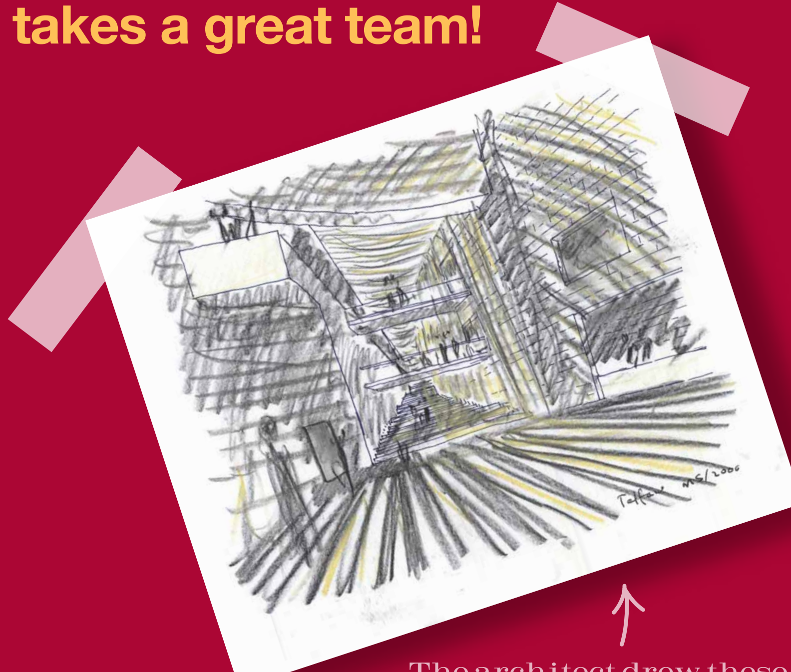
The architect drew these